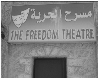
Jenin's Freedom Theatre, assaulted by Israeli military in Summer 2011

Israel seeks to impede the production and dissemination of Palestinian culture and to stifle the expression of dissident views within Israel. It sees culture as a weapon in the battle to “re-brand” itself as a civilised, cultured nation rather than a belligerent apartheid state, an occupier of Palestinian territories that deprives those under its control of all rights, and discriminates against its Palestinian citizens in countless ways.