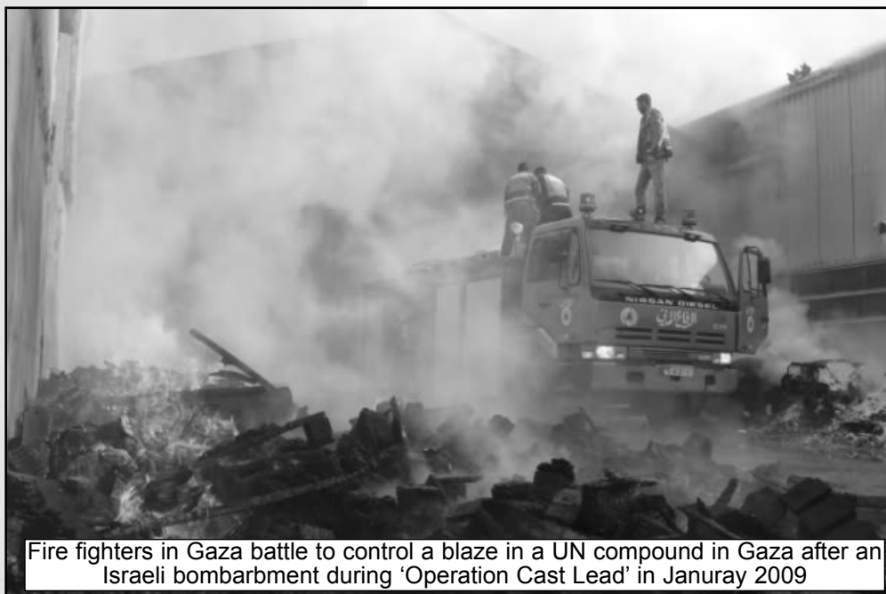
Fire fighters in Gaza battle to control a blaze in a UN compound in Gaza after an Israeli bombardment during 'Operation Cast Lead' in January 2009

The statement issued by the Histadrut can only be seen as a deliberate attempt to mislead the international labour movement and provide cover for the war crimes being committed by Israeli forces in Gaza. Trade unionists should remember this track record of deception when they hear claims being made by representatives of the Histadrut.