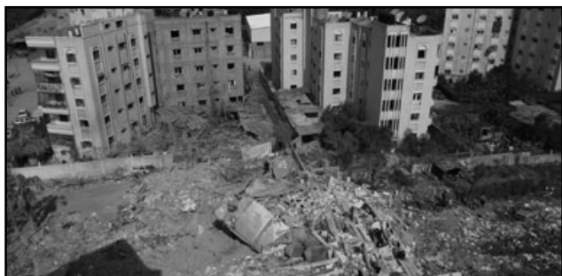
Gaza HQ of the Palestinian General Federation of Trade Unions (PGFTU) destroyed by Israel, Feb 2008

trade unions. However, Palestinian trade unions in the West Bank and Gaza Strip are not permitted to carry out trade union activities in Israel. The Palestinian members of Histadrut, may not elect, or be elected to, its leadership bodies."