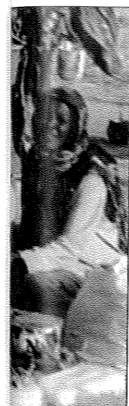
r family in a ighbouring

husbands or s have been d or gang- olence is in d to humili- ct fear, dis- nd destroy s.