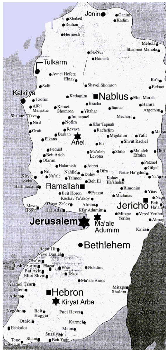
Figure 1. Israeli settlements in the occupied West Bank

Despite the fact that they are occupied, Israel has established settlements in these territories. According to international law, settlements are illegal. Article 49 of the Fourth Geneva Convention (Part 1) states: “The occupying power shall not deport or transfer parts of its own civilian population into the territory it occupies.” 1